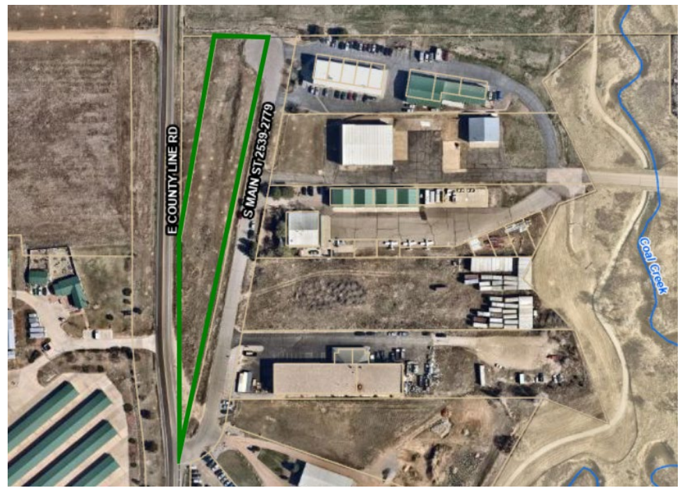
A+B=6.72 acres C=29.19 acres. D=2.99 acres South of Vista Parkway and east of County Line Road adjacent to Coal Creek.