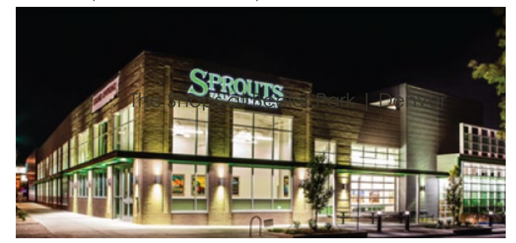
Bluebird Center | Denver