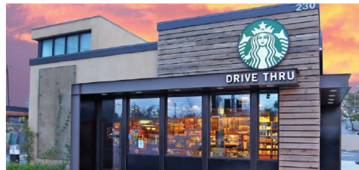
Starbucks | Denver

Evergreen Devco, Inc. was founded in 1974 and operates offices in Denver, Phoenix, Los Angeles, and Salt Lake City. We are a fully diversified real estate company with vast experience in all aspects of retail, multifamily, and industrial development.