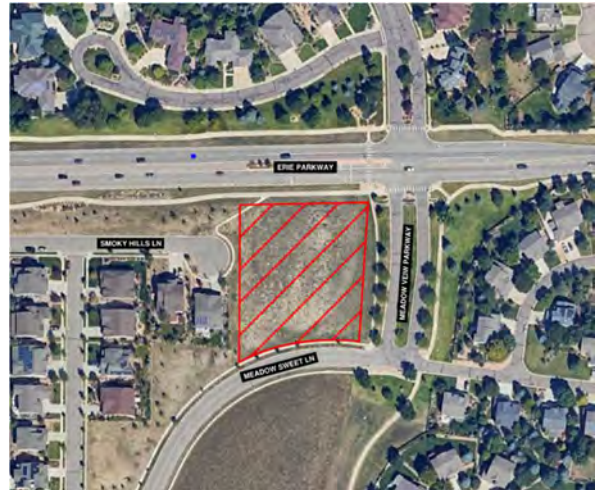
MAP 1: STATION 15 SITE LOCATION

It is bounded by Erie Parkway to the north, residential development to the west, Meadows Sweet Land to the south, and Meadows View Parkway to the east. The site encompasses approximately 1.56 acres, all of which is currently vacant and undeveloped.