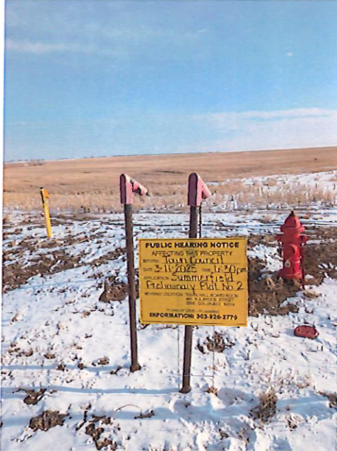
WCR 5 AND WCR 12