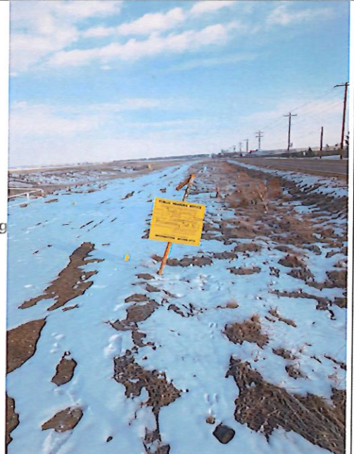
WCR 7 AND WCR 12

(Under each photo identify where the posting location is: example –Erie Parkway/County Line Road)