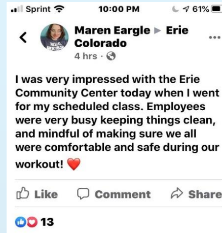
Positive feedback about ECC and COVID response