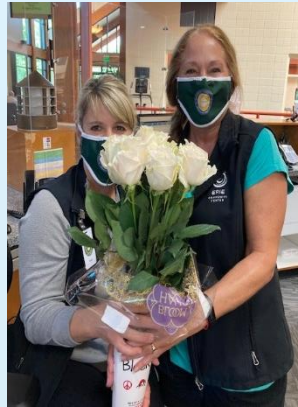
Resident thanks ECC staff with flowers for great customer service