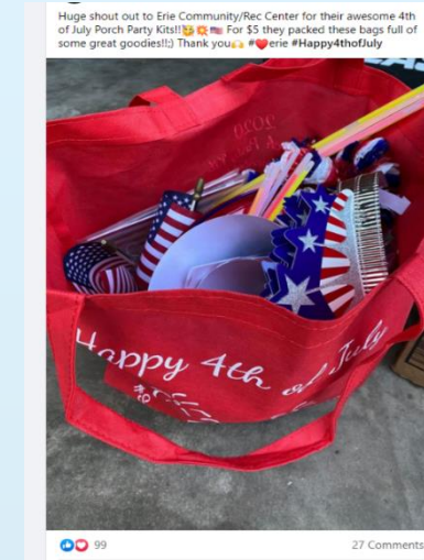
Nice shout out for the Porch Party Kits!

Nice call Regarding the Circuit Challenge