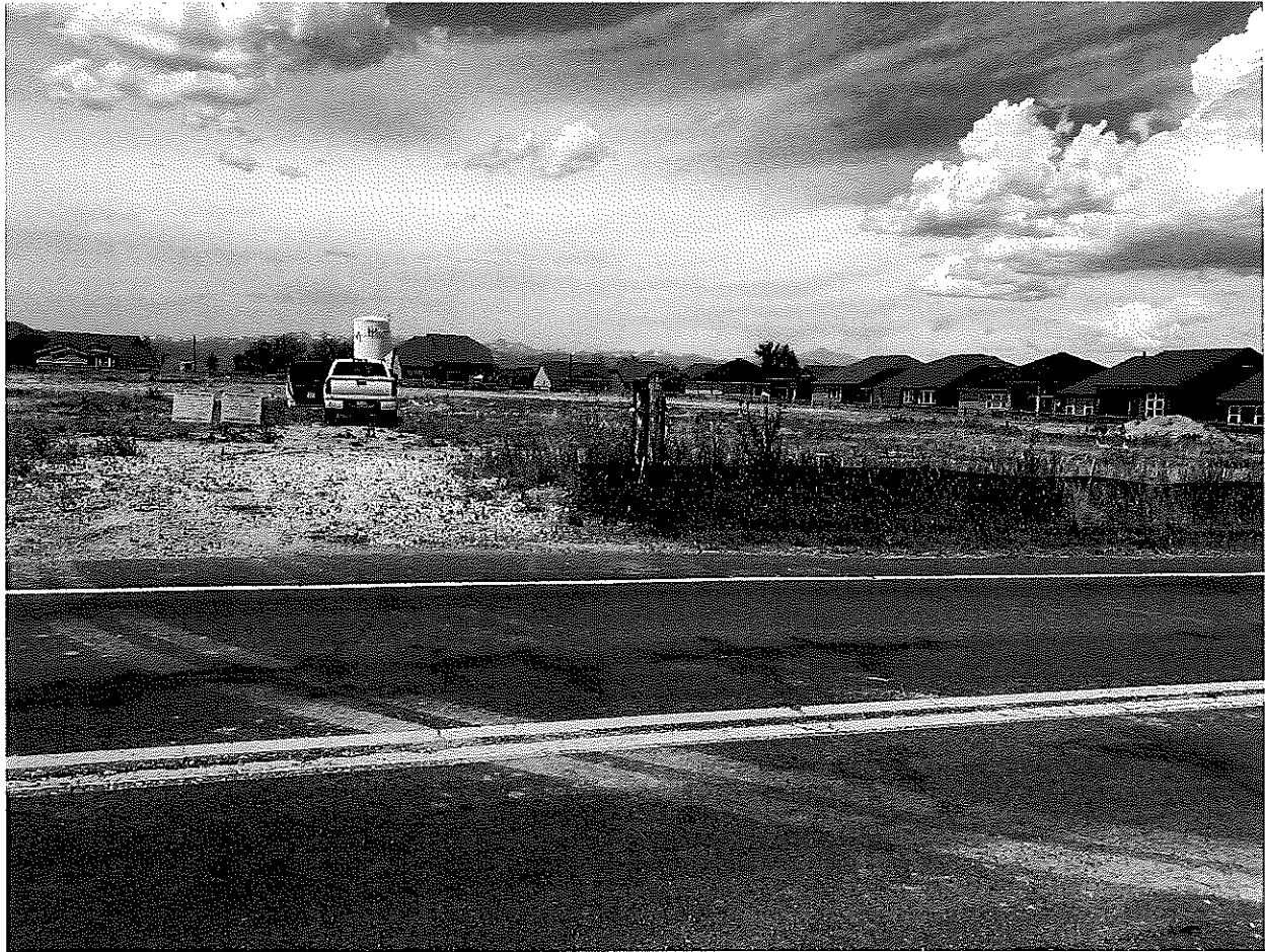
THIS IS ON 119 TH IN BETWEEN REX RANCH PLACE AND PIONEER PLACE LOOKING WEST