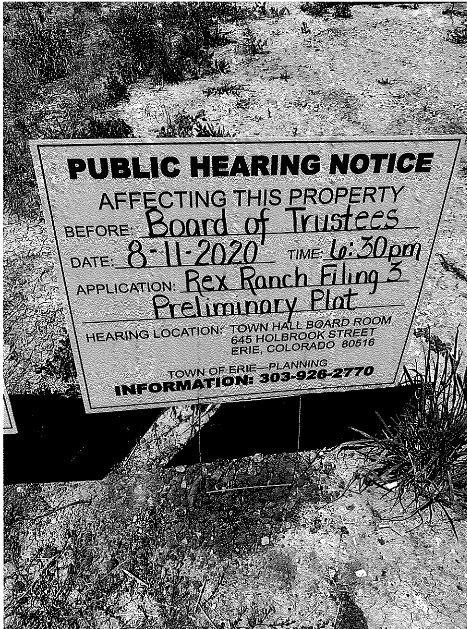
ZOOM UP OF THE SIGN POSTED

Rex Ranch Filing 3 Public Hearing Notice- Board of Trustees