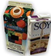
Paper milk/ juice cartons (no foil pouches, do not flatten)