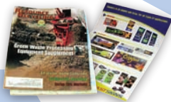
Magazines, brochures & catalogs