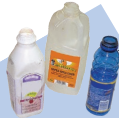
#1-7 Plastic Bottles

You can now place all recyclables in one bin!