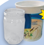
#1-7 Plastic tubs & screw-top jars (no lids, no #7 PLA compostables, do not flatten)