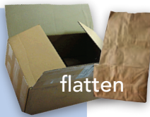
Corrugated cardboard & paper bags