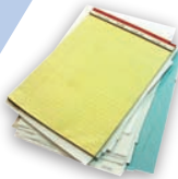
White or pastel office paper