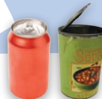
Cans (do not crush or flatten)