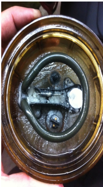
Iced Fuel Filter

As the temperature drops during winter months the moisture in fuel causes icing and the paraffin wax in fuel causes gelling which can result in expensive down time. HILL POWER PLUS+ enhanced diesel fuel contains the most advanced anti-gelling and anti-icing chemistries available in the market place today from the largest name in the additive industry. The fuels we use are routinely tested for correct treatment and the intricate additive injecting systems on our delivery trucks ensure proper dosage so you have the highest confidence in your diesel fuel.