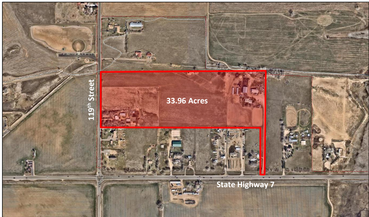
Parkdale Sketch Plan No. 2 area map

The subject property is generally located northeast of the intersection of Colorado State Highway 7 and N. 119 th Street.