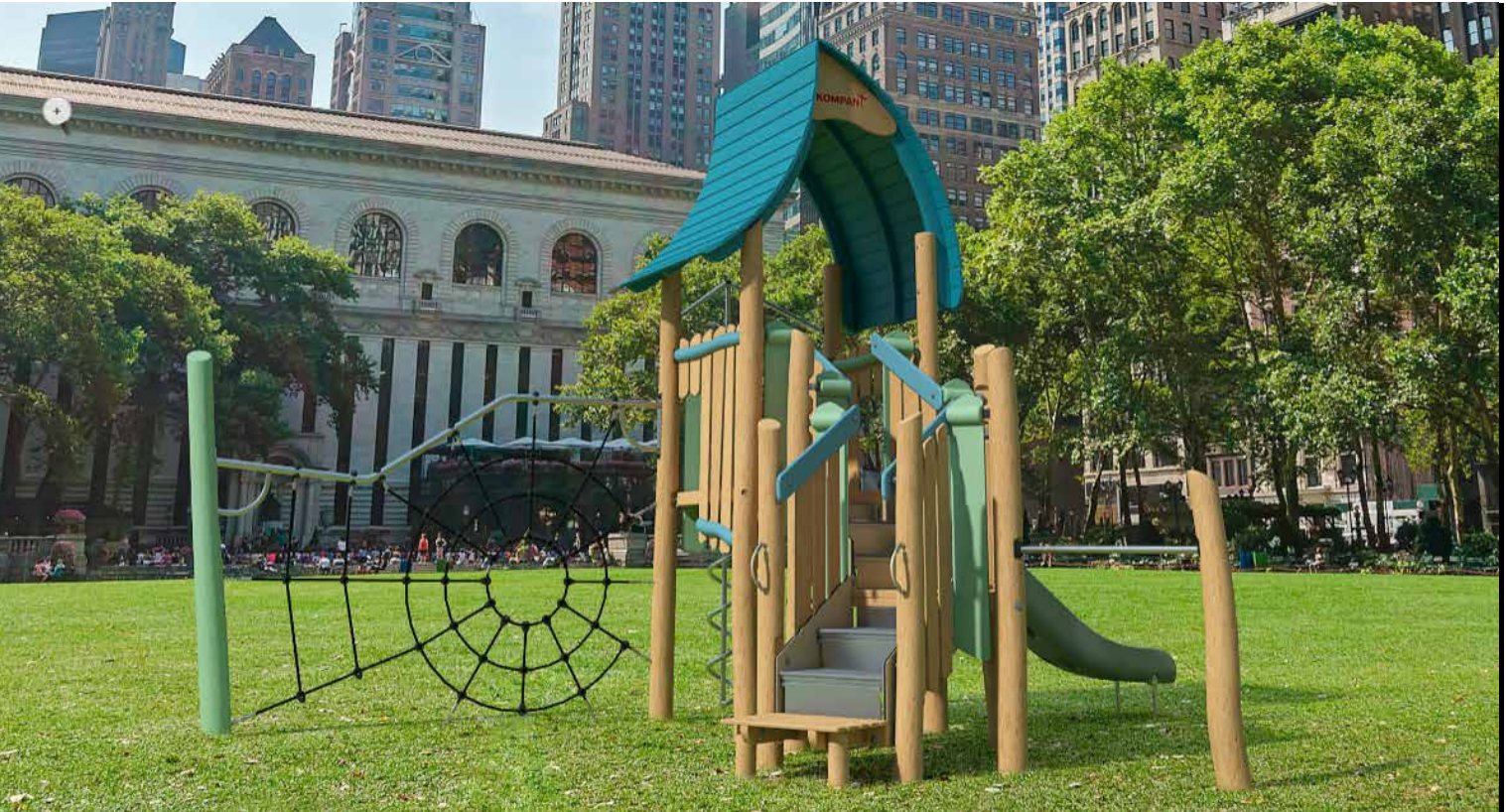
double tower with spider net