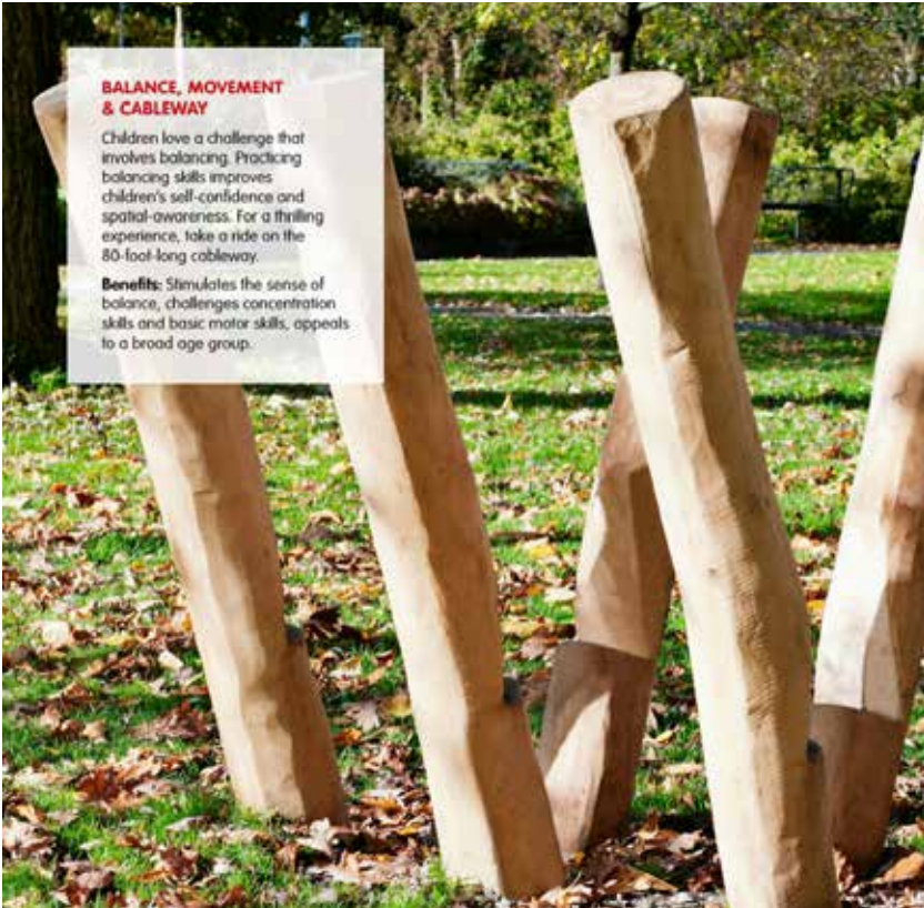
balance, movement & cableway