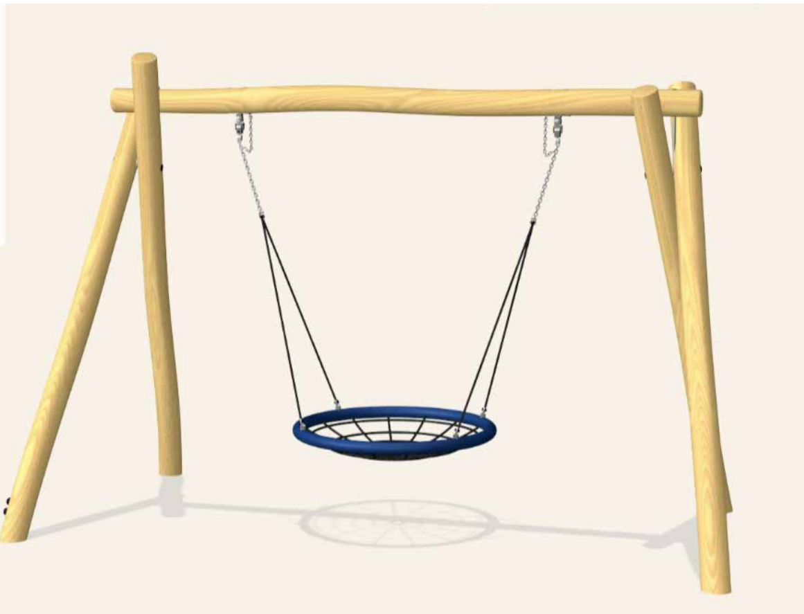
bird's nest swing