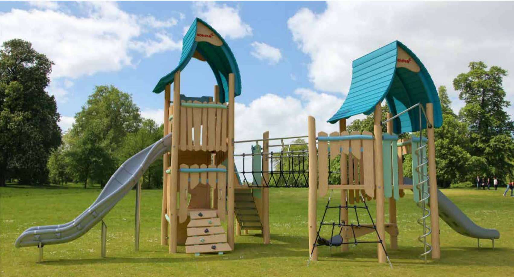
ropes and rocks play