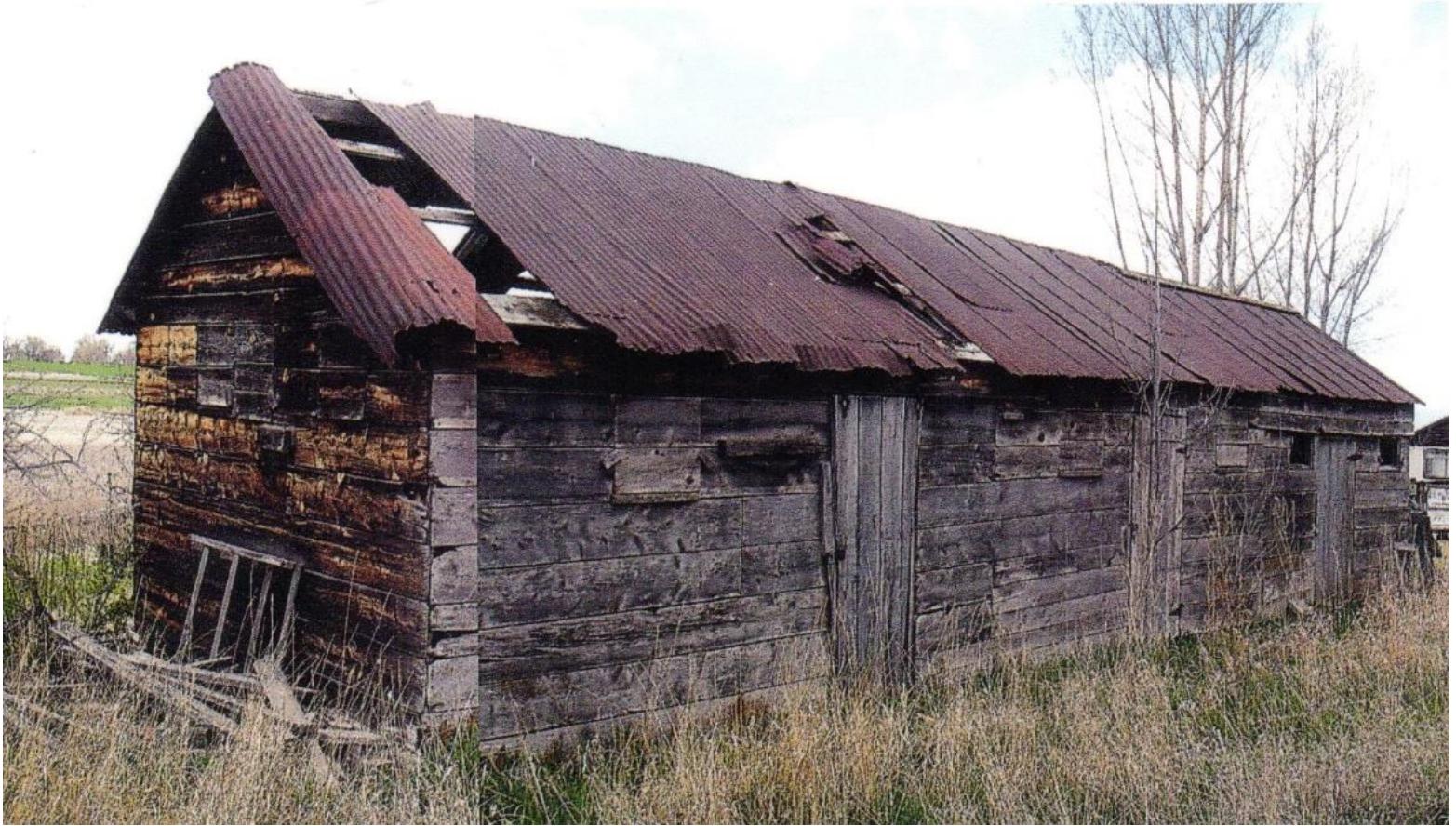
Site 5, Granery