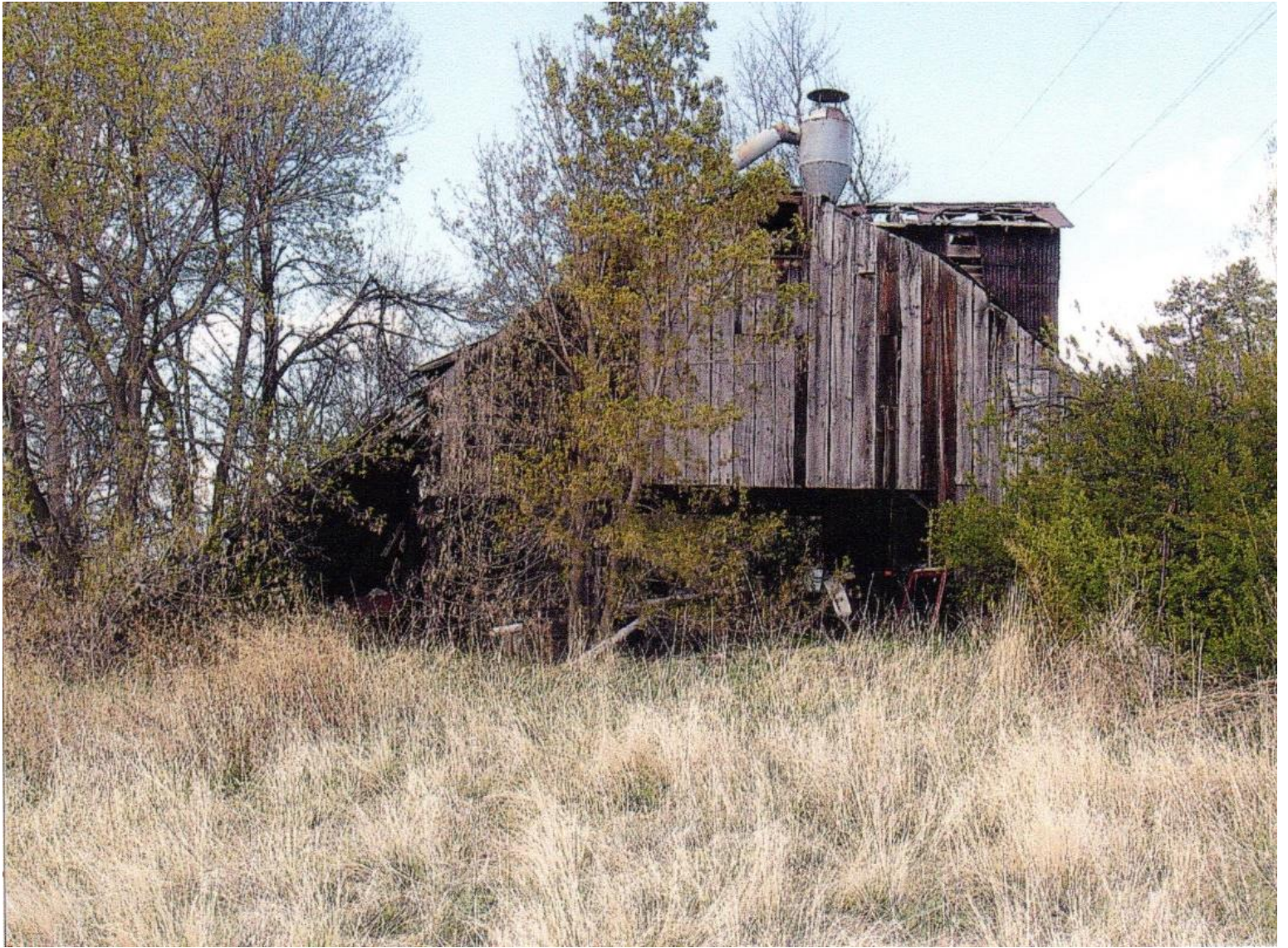
Site 3, Mill