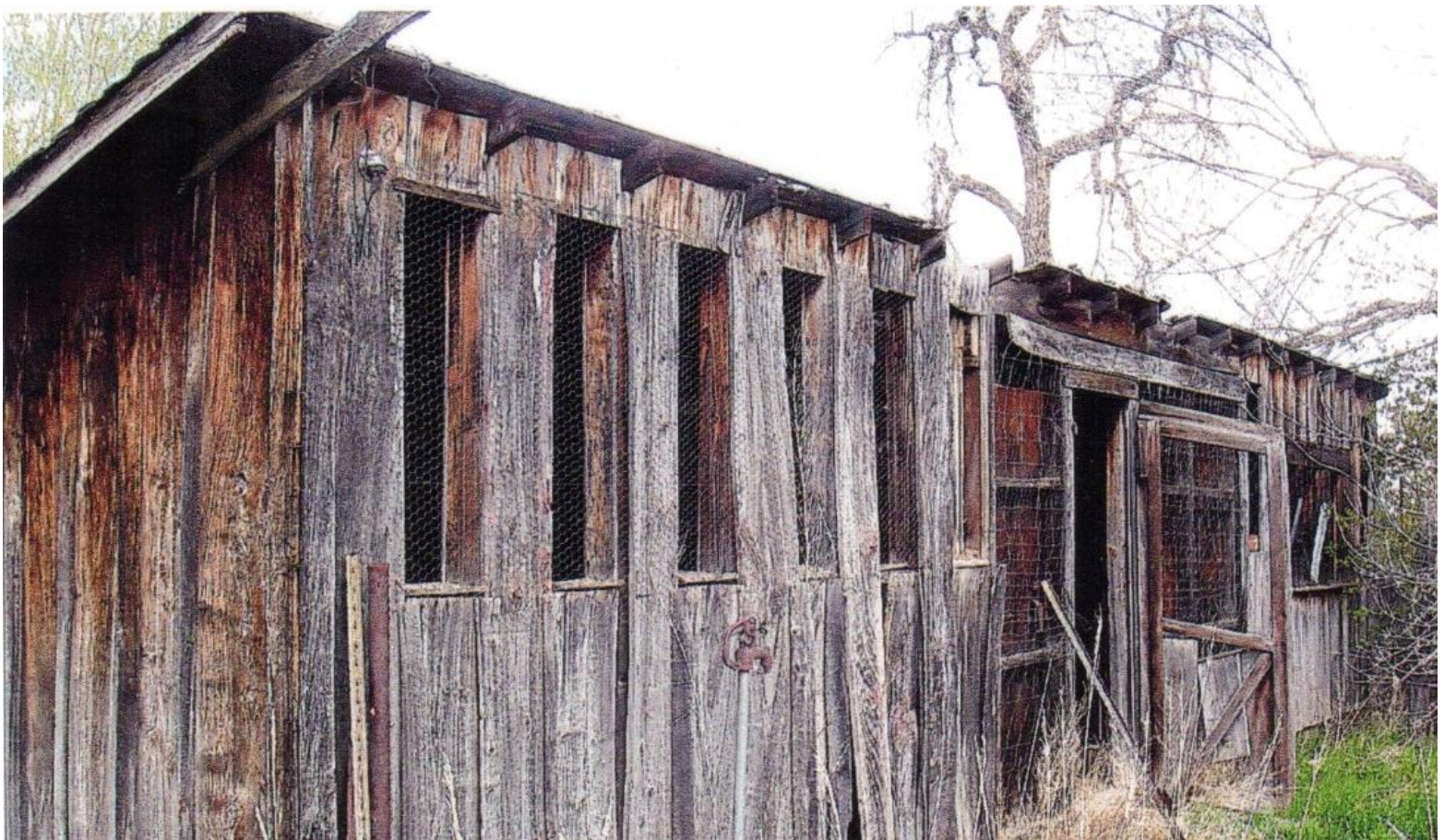
Site 4, Chicken Coop