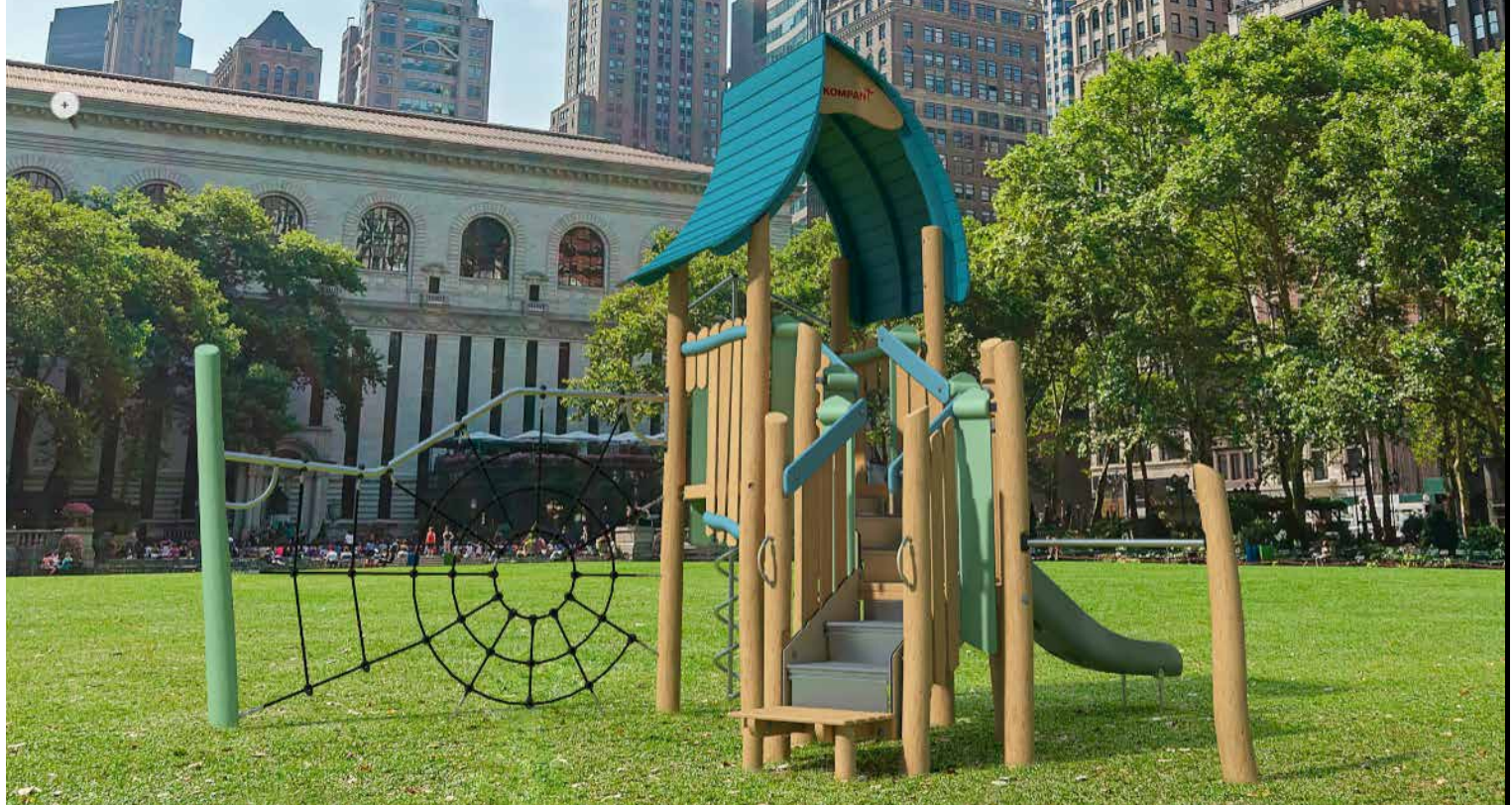
double tower with spider net