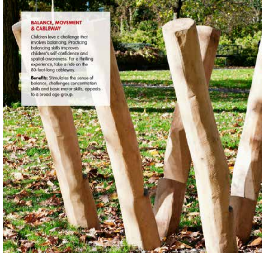
balance, movement & cableway