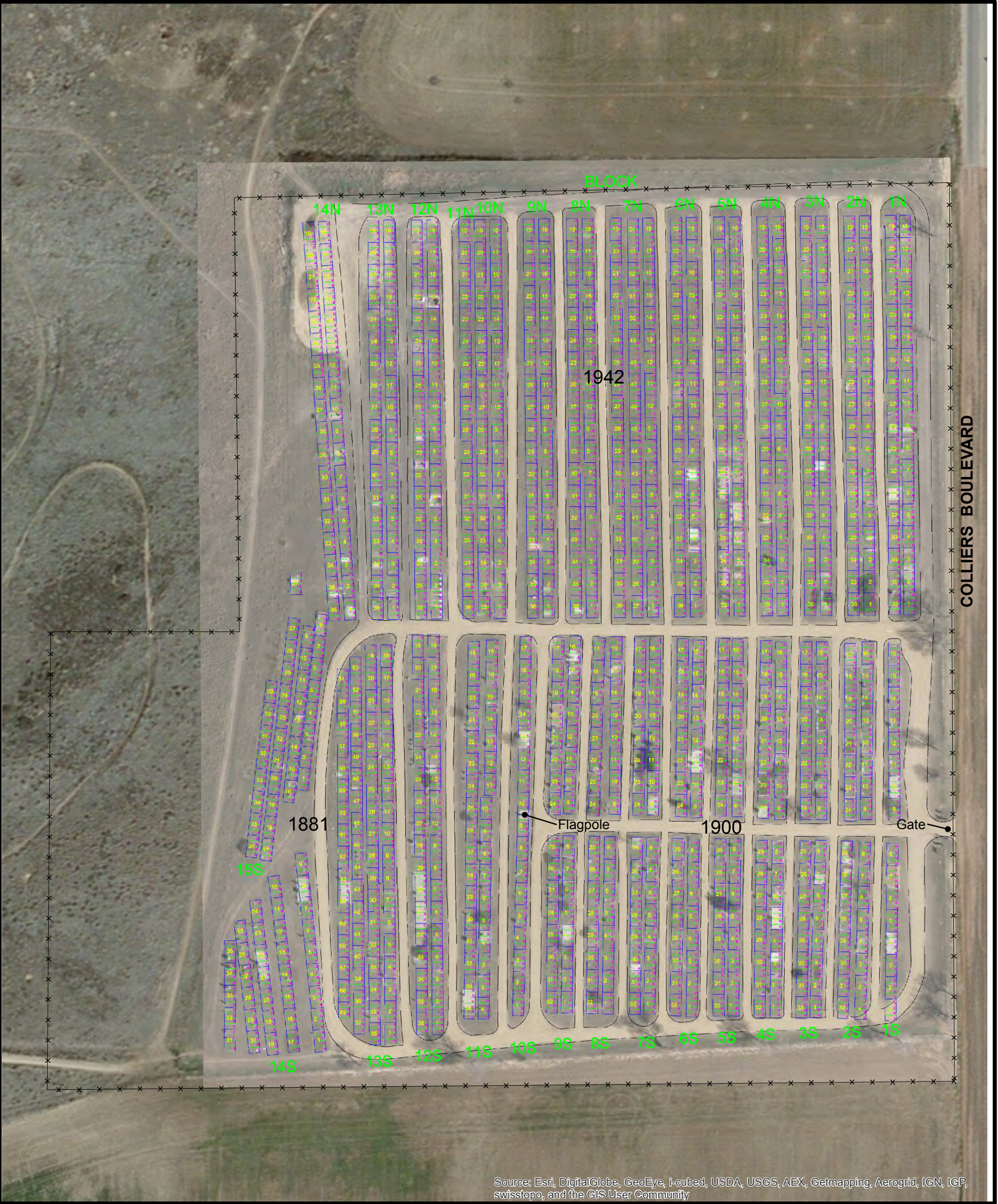
Erie/Mount Pleasant Cemetery, 520 Colliers Boulevard