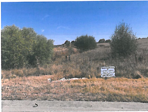
Highway 287 – Looking East