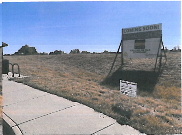
Arapahoe Road – Looking South

I, DEREK LIS, ATTEST THAT NOTICE WAS POSTED IN ACCORDANCE WITH THE ERIE MUNICIPAL CODE, TITLE 10.7.2 D. NOTICE WAS POSTED ON OCTOBER 15, 2019 FOR THE NEIGHBORHOOD MEETING ON OCTOBER 30, 2019 WHICH IS AT LEAST 15 DAYS BEFORE THE SCHEDULED NEIGHBORHOOD MEETING. THE PHOTOS, ABOVE, ARE A TRUE AND CORRECT REPRESENTATION OF THE NEIGHBORHOOD MEETING NOTICE SIGNS THAT HAVE BEEN POSTED.