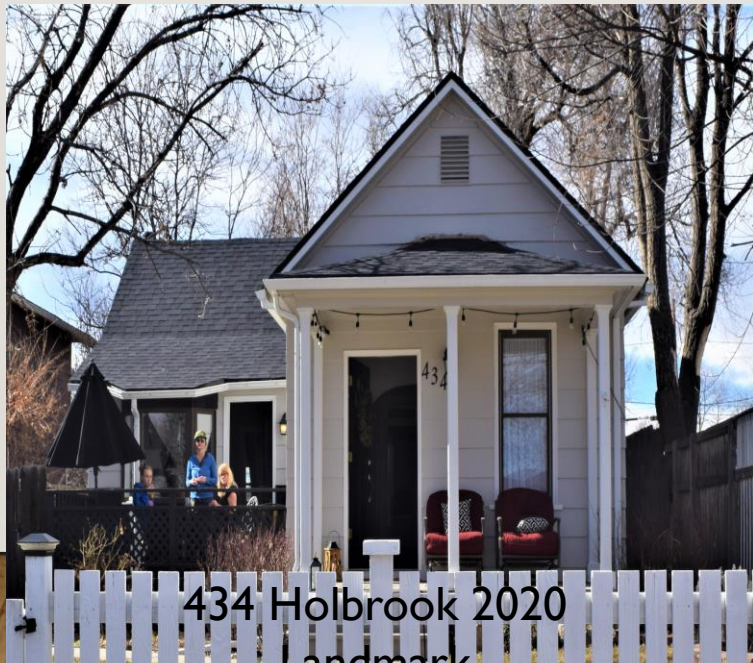
434 Holbrook 2020 Landmark