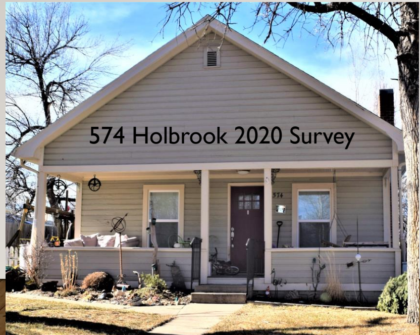
574 Holbrook 2020 Survey