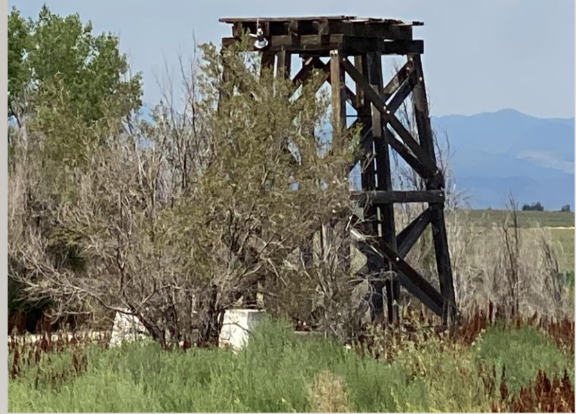
Eagle Mine I-25/ Erie Pkwy