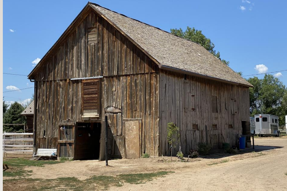
Genosa Farm Kenosha Rd