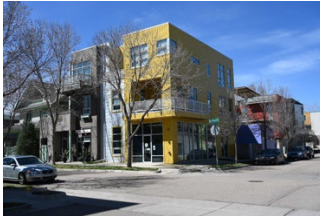
[Mixed Use Neighborhood (right picture)] Mix of residential attached homes, commercial, retail, and office uses in walkable block system;-6 Unsure/No Opinion;-7

T20. How familiar are you with the Town of Erie's Affordable Housing Program?