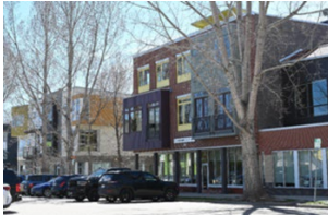
[Mixed Use Village (left picture)] Primarily vertical mix of residential, commercial, retail, and office uses in compact, pedestrian-oriented environment;-5