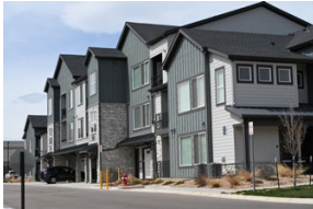
[Image of Residential-High] Townhomes, condos, apartments, stacked flats; -4