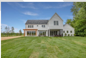
[Image of Residential-Rural] Larger lot, very low housing density;-1