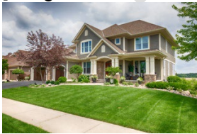
[Image of Residential-Low] Suburban-style, single family attached/detached units;-2