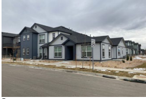
[Image of Residential-Medium] Mix of housing types, single-family, duplexes, and townhomes;-3