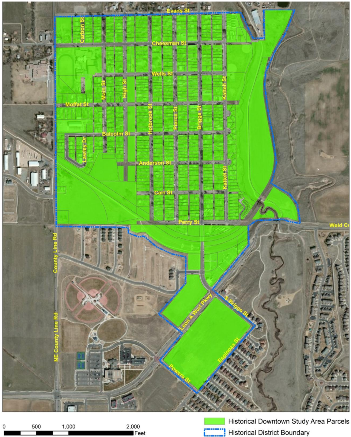
Figure No. 1: Historic Old Town Erie Urban Renewal Area