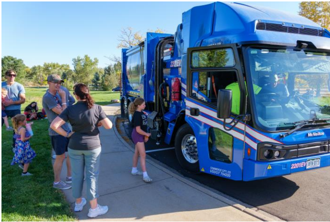
Louisville's first electric trash hauling truck with Republic