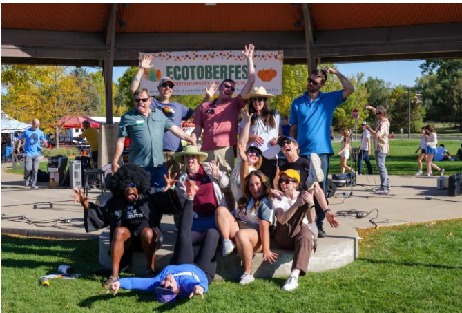
Sustainability and elected officials that supported the event