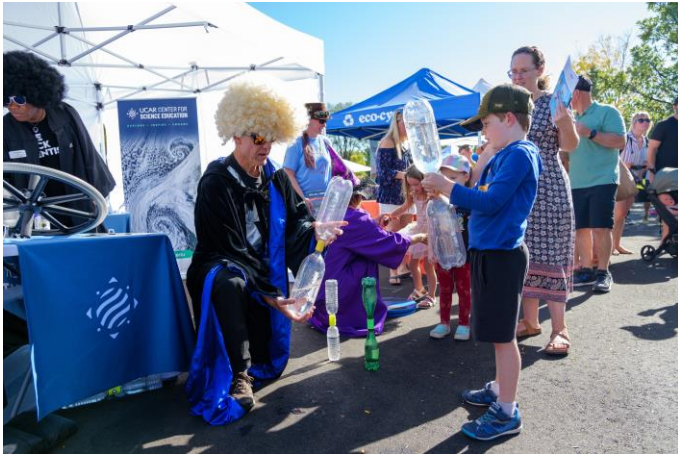
UCAR team sharing science experiments with participants