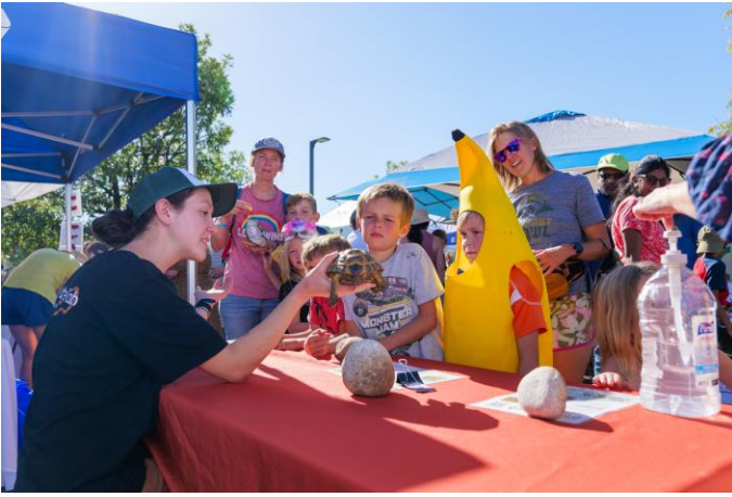
Vendor showing attendees a cute turtle