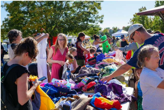
Halloween costume exchange supported by donated costumes from all four communities