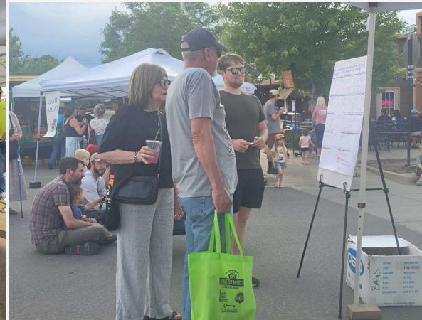
Farmers Markets 378 interactions