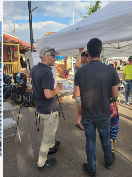
Town Fair 250 interactions