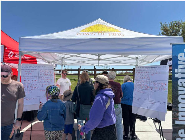
Arbor Earth Day 194 interactions