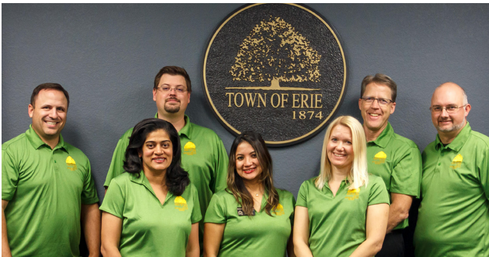
Town of Erie Sustainability Advisory Board.