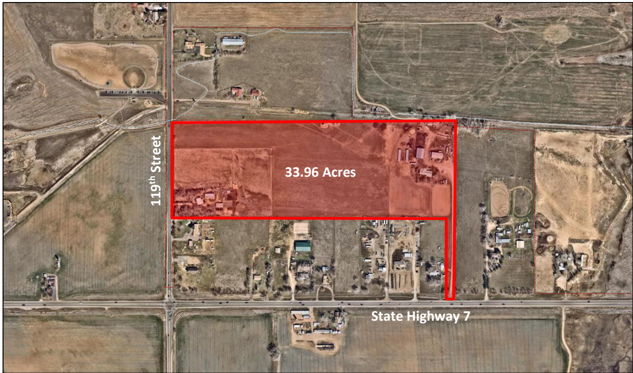
Parkdale Sketch Plan No. 2 area map

The subject property is generally located northeast of the intersection of Colorado State Highway 7 and N. 119 th Street.