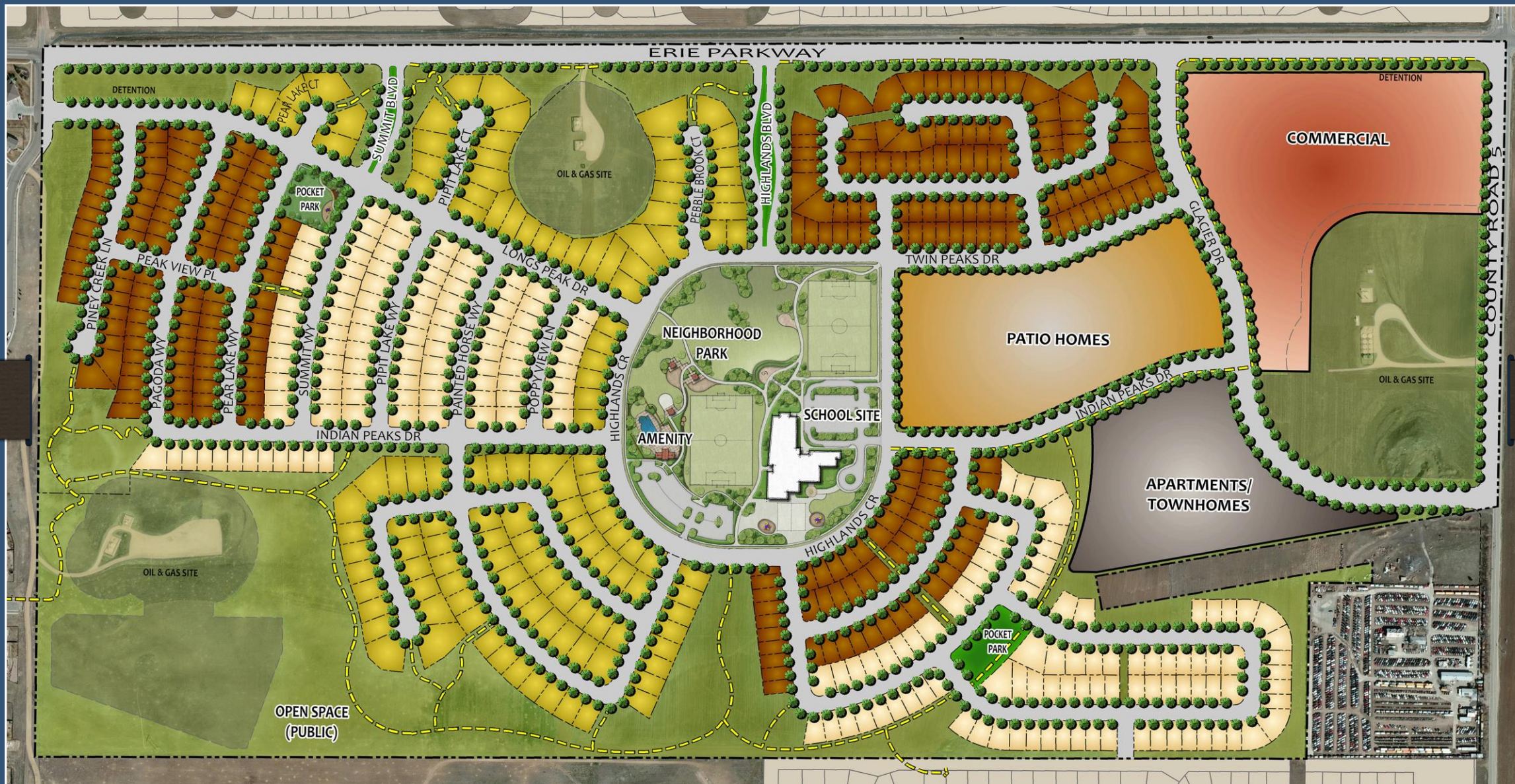
CONCEPT PLAN- 2013